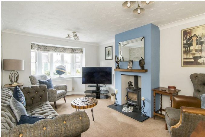
Sitting Room 17' x 10'8" (5.18m x 3.25m)

The bay-fronted sitting room has a wood burning stove set onto a slate hearth with an engineered timber mantle over. A set of double doors open into the dining kitchen.